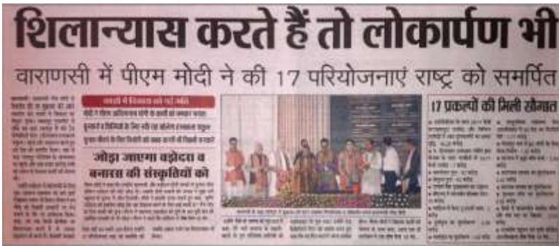
Jansandesh, Sep 23, 2017