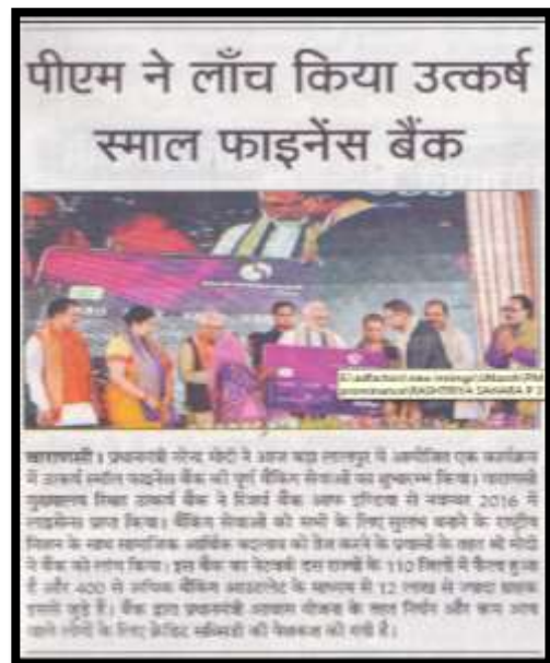
Rashtriya , Sep 23, 2017