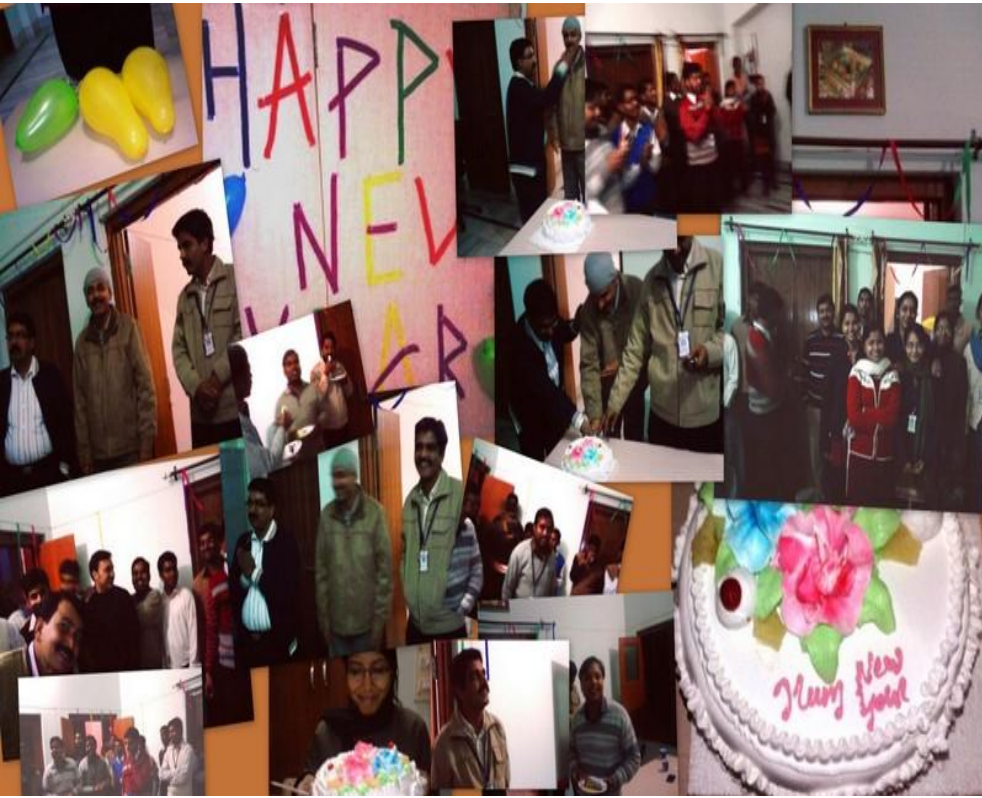
Team Utkarsh in Party Mood

Your Feed Back is important Please do write us at communications@utkarshmf.com